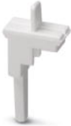
Switching lock, Length: 12 mm, Width: 8.2 mm, Color: white

Please be informed that the data shown in this PDF Document is generated from our Online Catalog. Please find the complete data in the user's documentation. Our General Terms of Use for Downloads are valid ( http://phoenixcontact.com/download )